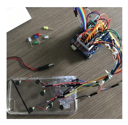
Figure 3: Vibration motors attached to a phone case which activate from audio buffers sent via Bluetooth to an Arduino.

To explore the creation of a different modal interface for music streaming using the intermediary, we developed a mobile haptic interface for feeling synthesized vibrations from the music. Using 6 vibration motors connected to an Arduino and a Bluetooth module, we prototyped an interface that connected wirelessly to the music streaming intermediary and activated specific vibration motors depending on the intensity of the audio buffer received.